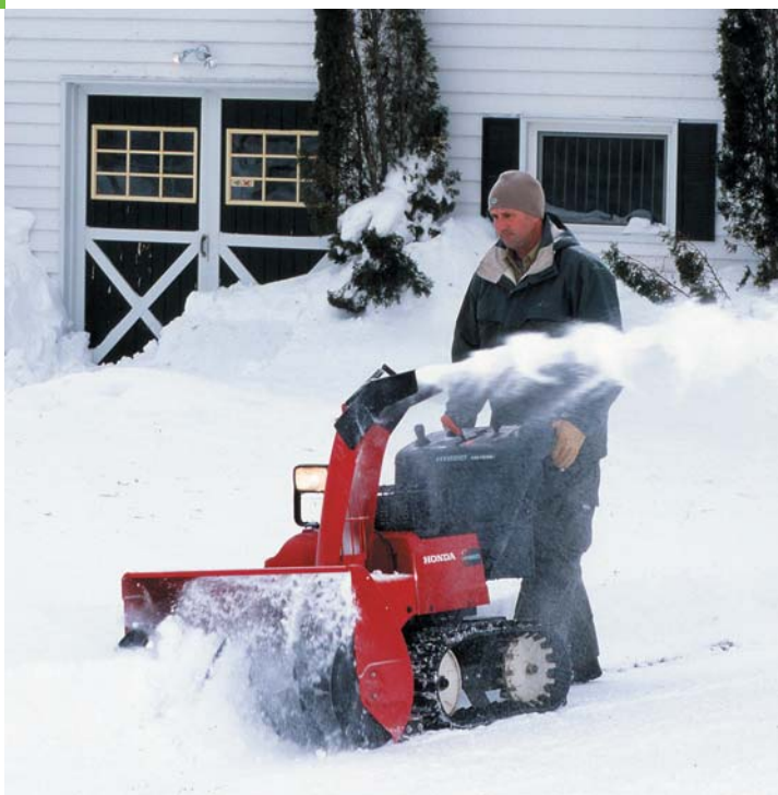
06760-768-000AH (All Models except HS35/HS521/HS621)