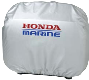
EU1000/2000 MARINE COVER