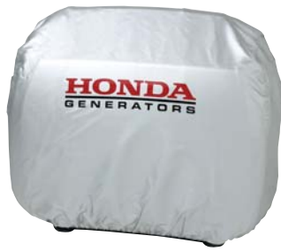
EU1000/2000/3000 SILVER COVER