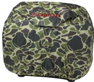
EU1000/2000/3000 CAMO COVER