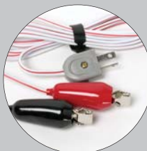
32650-892-003 STYLE B

Link 2 EU1000 together. Includes ground wire connection. Note: Output is limited by the capacity of the receptacles