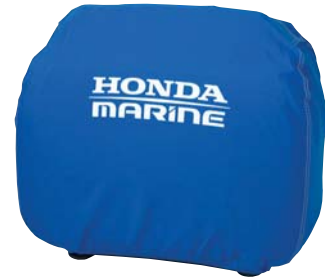
EU1000/2000 SUNBRELLA COVER