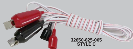
32650-825-005 STYLE C