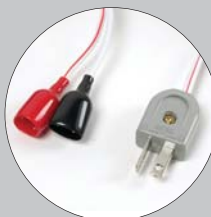
32650-884-005 STYLE A